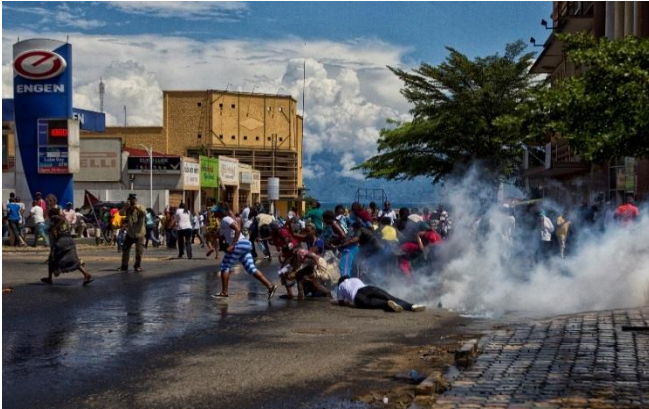
The Burundian capital Bujumbura has seen serious violence over the last year.

The last 12 months have seen a political storm spiral out of control in Burundi. Our Burundi Peacebuilding Expert describes a year of mounting violence.