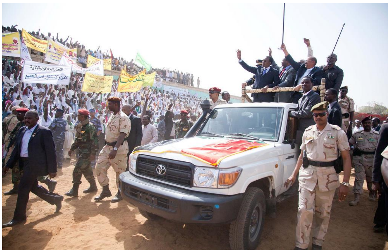
Chadian President Idriss Déby (standing in truck, front left). Déby stood for President for the fifth time this year, having first assumed power in 1990.

Many presidents and prime ministers in Africa are limited by law to two terms in office. But a wave of leaders are standing for a third term – with potentially violent consequences. Peace Direct's Local Peacebuilding Experts discuss the issues from across the continent.